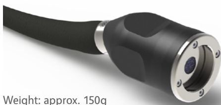
Weight: approx. 150g Size: d= 36,5mm; l= 65mm (without bending sleeve)