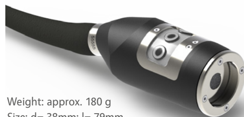
Weight: approx. 180 g Size: d= 38mm; l= 79mm (without bending sleeve)